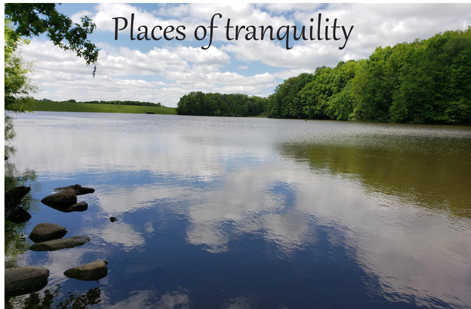
Photo of Hubbard Valley Park