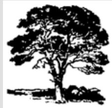
Medina County Park District