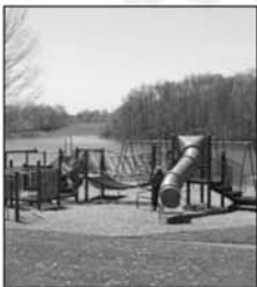
Children of all ages enjoy the playset at the park.

The Hubbard Valley has made a remarkable transition from Indian villages to the settlement of the Guilford Township frontier. Hubbard Creek was first tamed by grist mills, tanneries, and saw mills during the establishment of Seville.