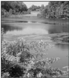
The reservoir is stocked with large mouth bass, bluegill, channel cat fish, and crappie.