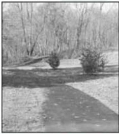
Nature trails offer walkers, joggers, and hikers opportunities to see wildlife.