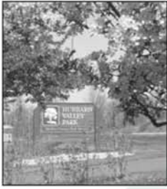
Fishing, sled riding, hiking, picnicking, and observing wildlife are a few activities available at the park.