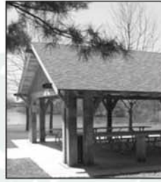
Two shelters are available for reservation, with one overlooking the lake.

A 1.25-mile nature trail leads park visitors around the lake and through a wooded area. As you walk the trail, wildlife viewing opportunities abound. A paved, all-purpose trail leads to both shelters, around the back of the sledding hill, to