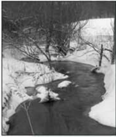
Plum Creek Park offers scenic views from one of its many trails.

Plum Creek Park is one of the best examples of recycling found in the county. The park opened on August 9, 1980. Formerly the Brunswick Township landfill, this site has been transformed into a scenic park by the park district. Beginning with the original 30-acre landfill site, the park district has added over 160 additional acres. The many intermittent creeks flowing through the shallow, wooded valleys provide a unique background for hikers and birdwatchers.