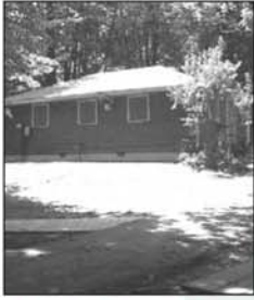
To take advantage of all your gatherings, an enclosed shelter is located on the north side.