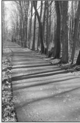
Discover the wildlife and vegetation at Plum Creek Park by hiking some of its wonderful paths.

The park offers an enclosed picnic shelter on the north side available by reservation. This facility is heated and air conditioned to provide a great place for your family reunion or meeting. An open-air shelter can also be reserved on this side of the park. The south side offers an open-air shelter for group use by reservation. It also has a playground for children. Individual tables and grills are located on both sides of the park for your enjoyment. Both the north and south shelters are fully accessible via paved paths.