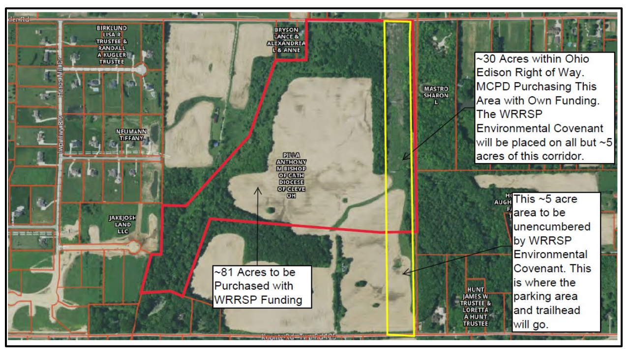
Figure 2. Project map

The purpose of the WRRSP is to counteract the loss of ecological function and biological diversity that jeopardizes the health of many of Ohio's water resources. In the program, entities such as park districts and land conservancies (implementers) undertake ecologically restorative and protective projects. Borrowers from the WPCLF voluntarily sponsor such projects in return for interest rate discounts. Ohio EPA foregoes a portion of the interest that borrowers would repay to the WPCLF and advances it to implementers to carry out the ecologically beneficial projects. Properties are acquired, restored, and managed in perpetuity under a management plan and an environmental covenant which establishes use restrictions on the land.