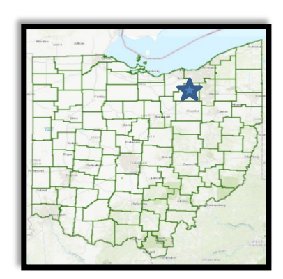
Figure 1. Project location map

Medina County Park District (MCPD) seeks $1,108,500 in funding through Ohio EPA's Water Resource Restoration Sponsor Program (WRRSP) to purchase and establish the Koontz Creek Nature Preserve (KCNP), a project located at approximately 450 Fixler Road, Sharon Township, Medina County (Figure 1). The project includes the purchase of 105-acres of a 111-acre property including 4,760 linear feet (LF) of Koontz Creek, approximately 4,319 LF of mostly Class III primary headwater habitat (PHWH) stream that flows into Koontz Creek, and 18 acres of existing high quality wetlands (Figure 2). The project also includes the restoration of 1,530 LF of stream/erosion gullies, and approximately 10 acres of mosaic seasonal wetland. The project will increase habitat connectivity in the Wolf Creek watershed by adding to five existing MCPD properties located both upstream and downstream of the project. It will also help protect the Wolf Creek watershed which serves as the city of Barberton's water supply.