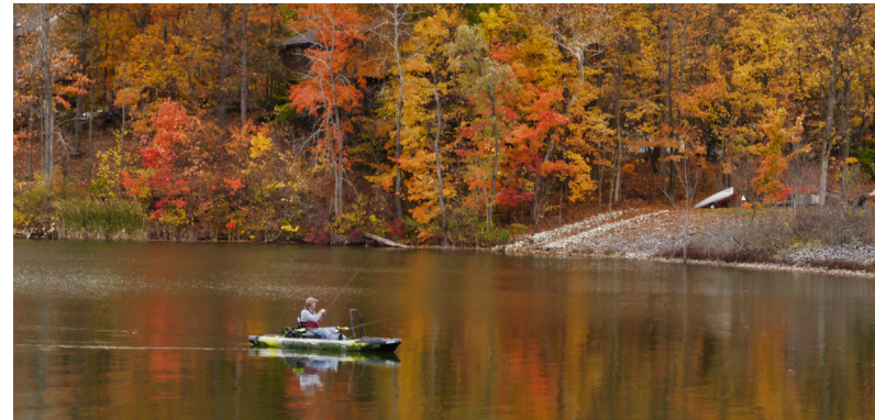
Hubbard Valley Park